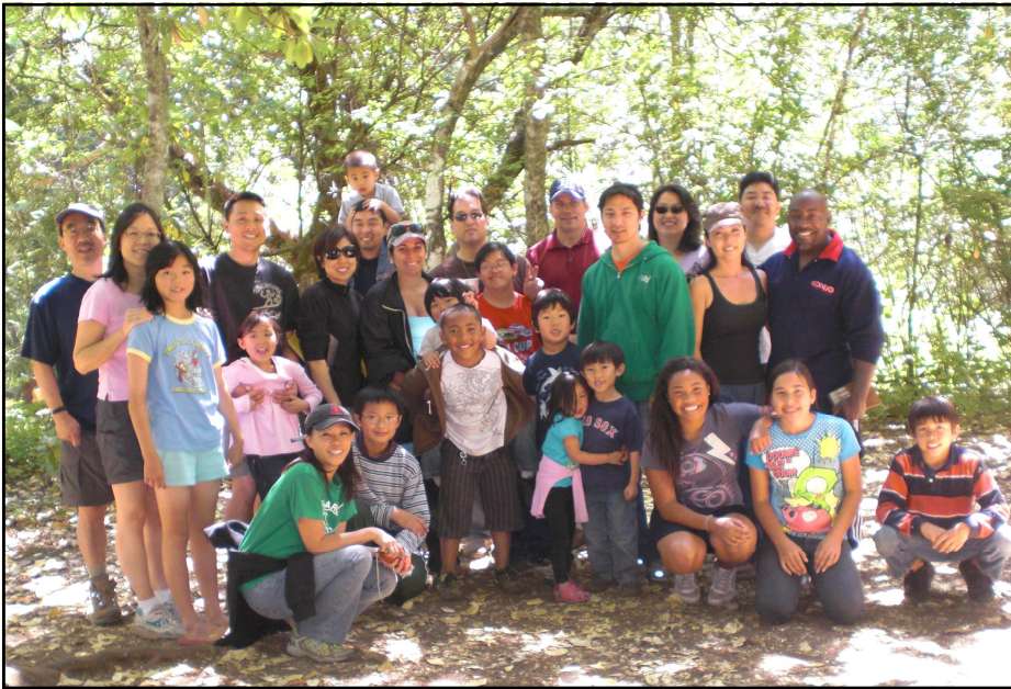
Annual Camping Pictures!! Bothe - Napa State Park 7/19-21, 2009